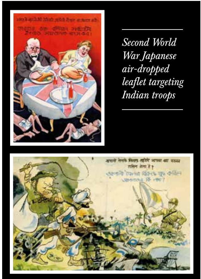
Second World War Japanese air-dropped leaflet targeting Indian troops

What are the challenges for the future? There are many and I will mention just one – the huge scope for stronger international collaboration. So much of what we own is propagandist in its intention and this provides opportunities for particularly lively dialogue.